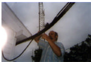
A NERA volunteer rigs the coax on the Fork Mountain 443.250 linked machine.

NERA (the Network Engineers Repeater Association, a group of hams who are communications engineers in the D.C. area), operates a wide area link system.