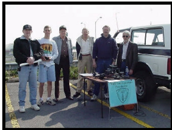
The March of Dimes communications crew pauses for a picture