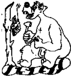
We can bear-ly keep up with all the changes.

Thanks to all the hams who have informed the Monitor Editor of recent changes! Below could be called the "Gossip" column of the Monitor! If you don't see your change below, submit it to the newsletter editor!