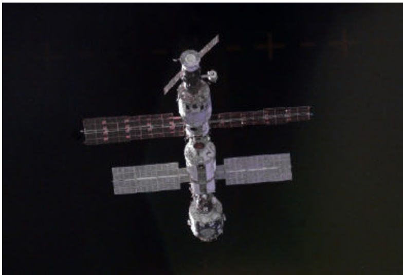
A Really Rare DX Station 123 Miles Above the Surface of the Earth, Aboard the Orbiting International Space Station

The ham radio station aboard the International Space Station has been delivered and installed. The station still will need a few minutes worth of set up once the first crew arrive next month. All three astronauts named in the first crew will hold ham licenses, and plan to work earth-bound amateurs whenever the opportunity arises. This month's CQ magazine has a nice article on ham radio aboard the ISS. When was the last time you got to talk to an orbiting astronaut from your HT?