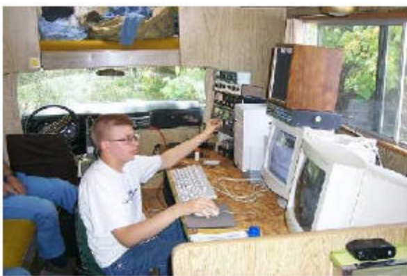
N4DSL tries his hand at contesting. Of course, in a RTTY Contest, you actually try out BOTH your hands at contesting!