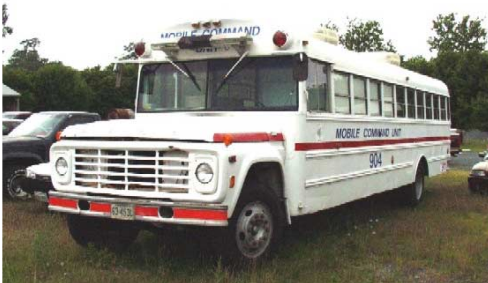
At left, the 1975 converted school bus serving as the old Rockingham County Communications Van. Above, the interior of the van features several operating positions, along with additional space for conferences, planning, resting, and other operations.