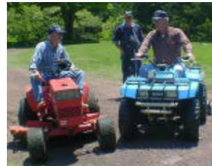
My mower's faster than yours! Is not! Is too!

Thanks to the crew that mowed the grass in the field where Field Day was held! Hats off, and a tip of the blade to: KE4GKD, W4PJW, N4BCC, K4DJG, KD4WWF, and KE4HVR.