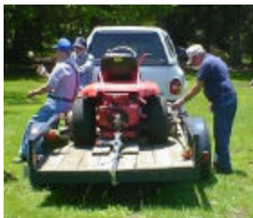
Having a "ball" while others do the real work!