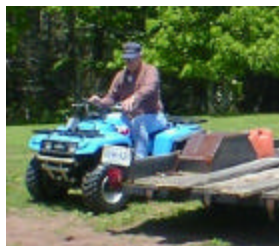
Someone figured it would be a good time to show off a new toy!