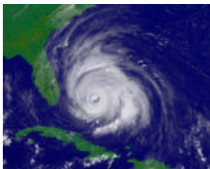
Hurricane Season Started June 1. Is your station and jump-kit ready?