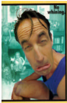
This year the Valley sure could've used a little rain on Field Day!