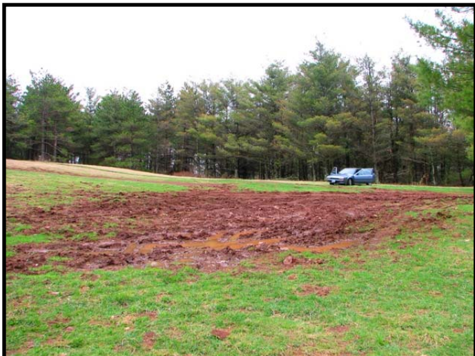
Above: New mud hole adjacent to the Welcome Center location