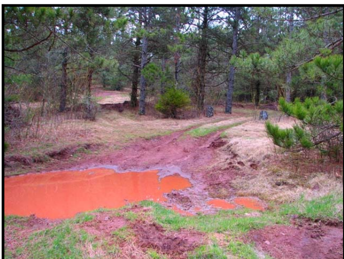
Above: In front of the original VHF site.... Yuck!