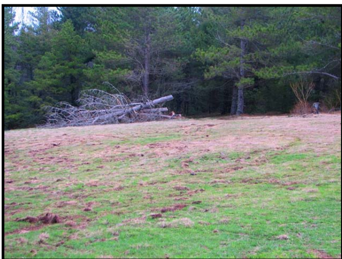
Below: Near the CW site: now a brush pile.