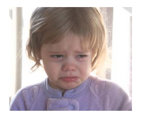
Is This You? It is if you don't get your dues to your club Treasurer by the February meeting.

October 1-2: Shenandoah 500 NVTRA motorbike ride