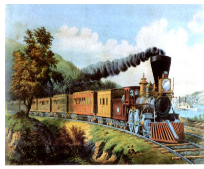
AMERICAN EXPRESS TRAIN