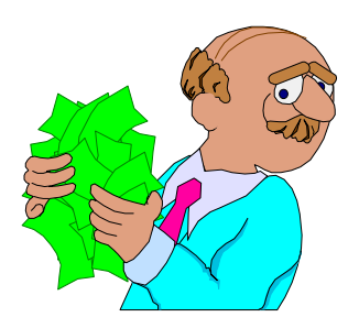
Contests: A good way to collect QSL cards!